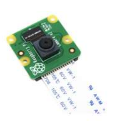
Figure 3:- Web Camera