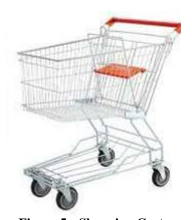
Figure 5:- Shopping Cart

A shopping cart, commonly referred to as a shopping trolley in certain regions, is a specially designed wheeled vehicle created to enhance the shopping experience in retail environments. It serves as a practical and indispensable tool for customers, offering assistance in transporting selected items conveniently throughout a store. The primary purpose of shopping carts is to facilitate the gathering of goods as customers navigate through aisles and make their product selections.